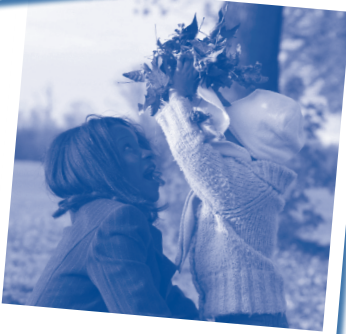
Take a walk together