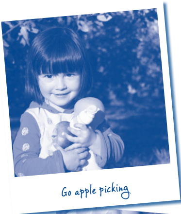
Go apple picking