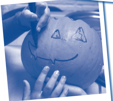
Decorate your own pumpkin