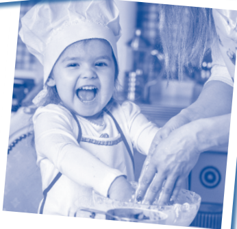
Bake a pumpkin pie